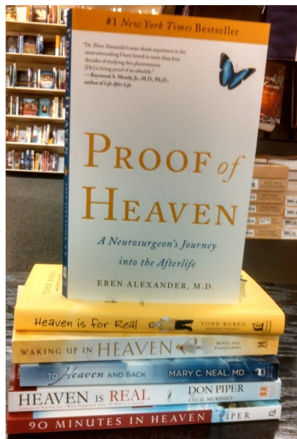
NDEs provide no proof of heaven but do provide evidence for the natural afterlife.